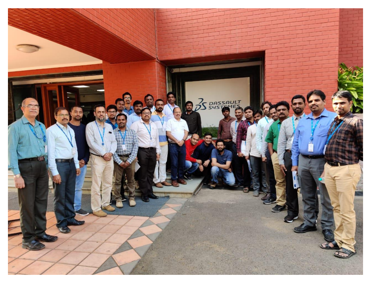
Faculty Visit to R&D Centre, Pune (Maharashtra)